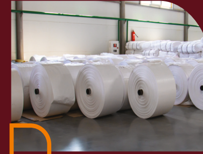
PP WOVEN FABRICS