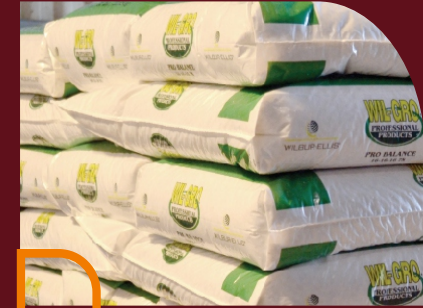
BOPP WOVEN BAGS