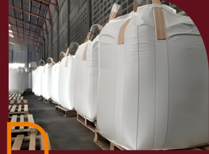
PP JUMBO BAGS