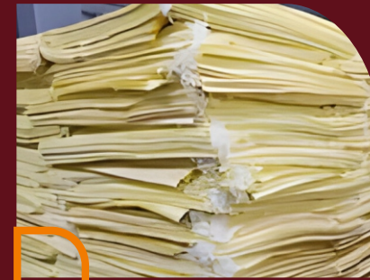
PP WOVEN BAGS / SACKS