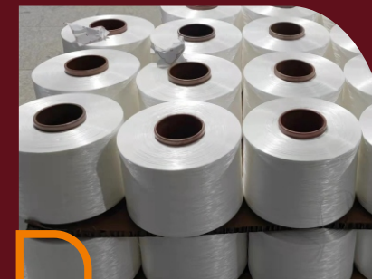
PP MULTIFILAMENT YARN